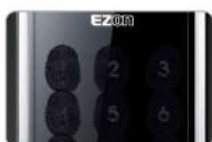
Impossible to guess user access code due to random fingerprint marks