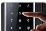
Press the user access code