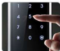
User Access Code