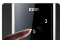
2 random numbers appear before entering user access code

User access code will be pressed after press two random numbers, preventing intruders from checking the fingerprint marks left.