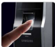
Biometric Access System