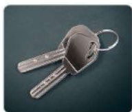
Mechanical Override Keys